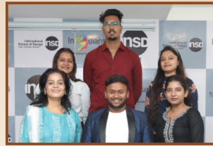
Transformable Furniture Team with Mentors